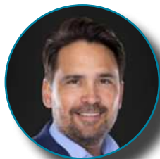
Hon Simon Bridges Chief Executive Officer & Delegation Leader Auckland Business Chamber